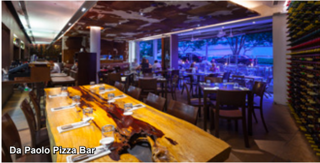
Da Paolo Pizza Bar